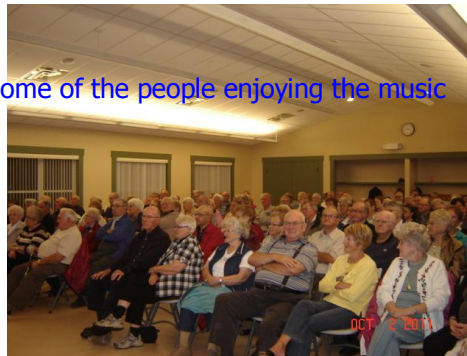
Some of the people enjoying the music