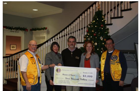
Quispamsis Lions donate to the District 6 Breakfast program