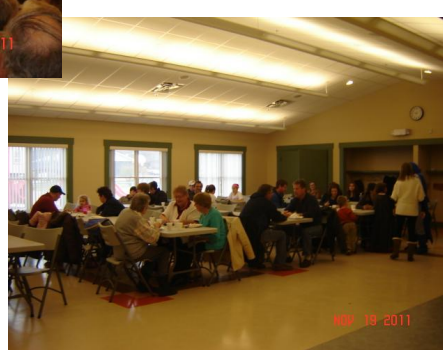
The pancake breakfast to support Christmas Daddies