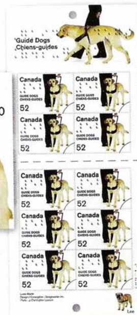
Braille translation for Guide Dogs appears at the top of the stamp booklet and in the top left corner of the OFDC.