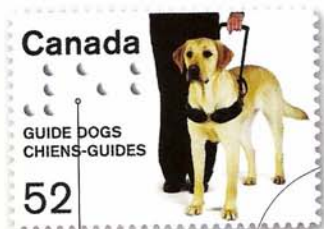
Note that the denomination appears in Braille. La valeur faciale est inscrite en braille sur le timbre.