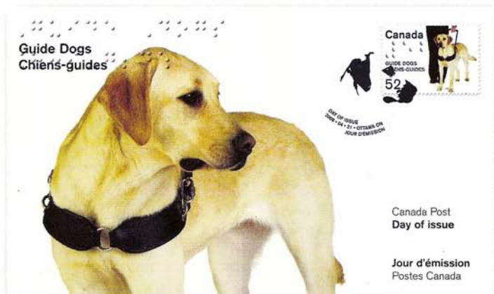
OFDC PPJO 413698131 $ 1.52

Philatelic products are available at post offices and through authorized stamp sales agents across Canada. Customers may visit the Stamps & Gifts Online store at www.canadapost.ca/collecting for more information.