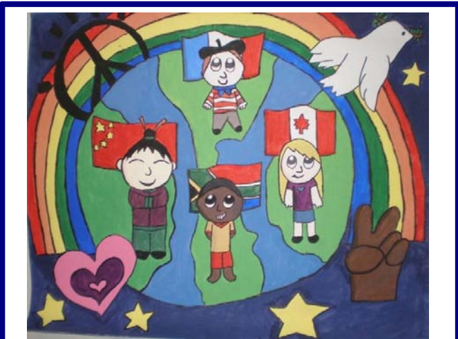
Multiple District N Peace Poster Contest Winner

6 Rooms with 1 Double Bed and 1 with 2 Double Beds. Cots available $75.00 + tax