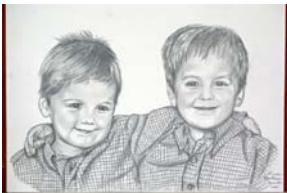
Two Lil" Boys

After a hardy rain-storm has filled all the potholes in the streets and alleys,