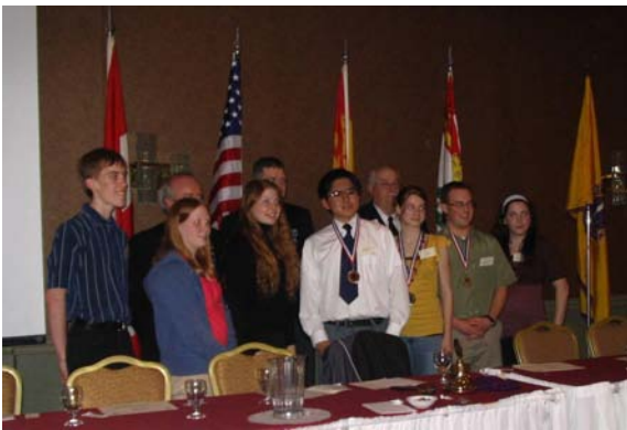
Left Photo - Speak Out Contestants