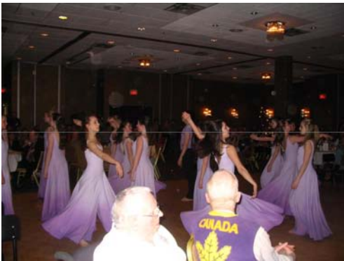
Entertainment - Local Dance Group