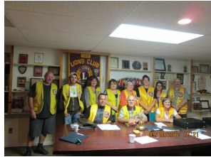
Irishtown Lions Club. The Irishtown Lions are re-building their

Then on September 10 th I inducted 6 new Lions into the