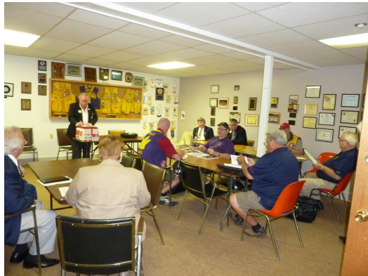
Zone Chairs meeting