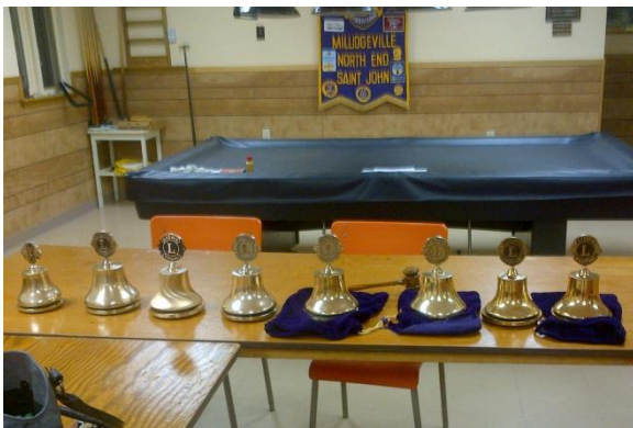
All polished up, ready to display

Any time a club goes from almost closing its doors to increasing its membership by ten members it is cause for celebration. And what better way to celebrate than to surround yourself in other club's gongs!