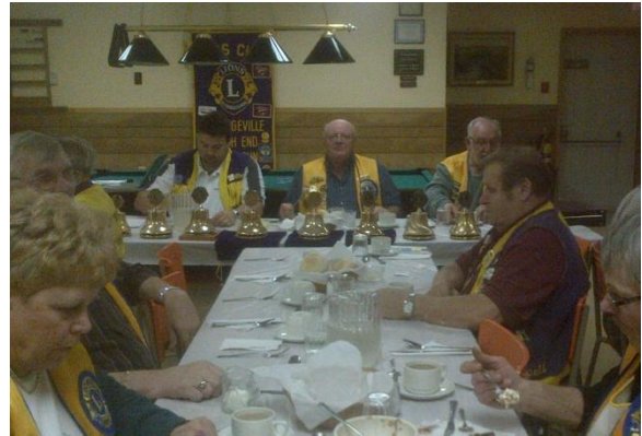
Sharing a meal before sending two gongs back home

And if you're going to travel as Lions then you should travel as a Pride. With the exception of a whirlwind visit to Geary there was not a single other club that was visited with less than seven members. In some cases we showed up with more than ten. The fruits of our labor were obvious not only in the row of club gongs lined up at our head table but in the renewed sense of willingness to be active. No sooner would we return from one visit than we'd be planning the next such that in the span of six weeks we visited seven clubs.