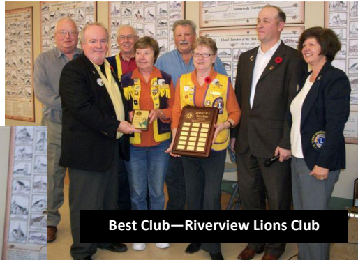
Best Club—Riverview Lions Club