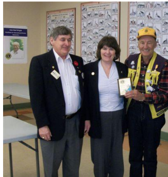
LCIF Donations - North & South Esk Lions Club