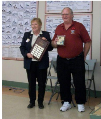
Most LFC Donations - Simmonds Lion Club